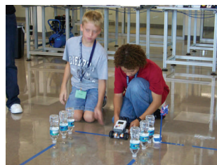
Team ready to start their robotics in the "maze" challenge.

For pictures and videos visit www.fl-ate.org/robotic_camp_08/index.html