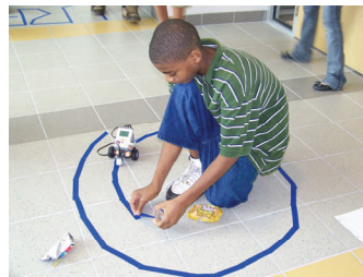
Designing a "light sensor" challenge course.

robotics technology in providing solutions for the physically handicapped. To view snapshots of the event visit http://fl-ate.org/robotic_camp_08/index.html